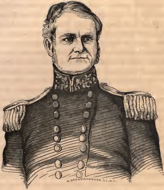
GENL. WILLIAM J. WORTH.